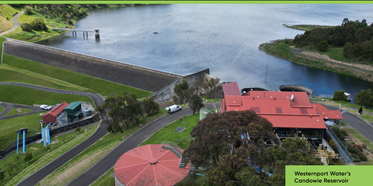
Westernport Water's Candowie Reservoir

water-quality testing, main-break reporting, and calibration tracking. As your needs change, the platform scales with you, backed by a local Australian team that understands your operational and regulatory challenges. With secure cloud hosting and ISO-aligned governance, Asset Vision gives you the confidence and control to deliver safe, reliable services to your community.